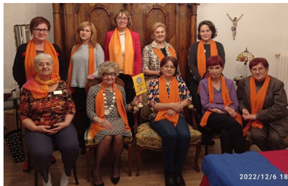
Members of SI Budapest